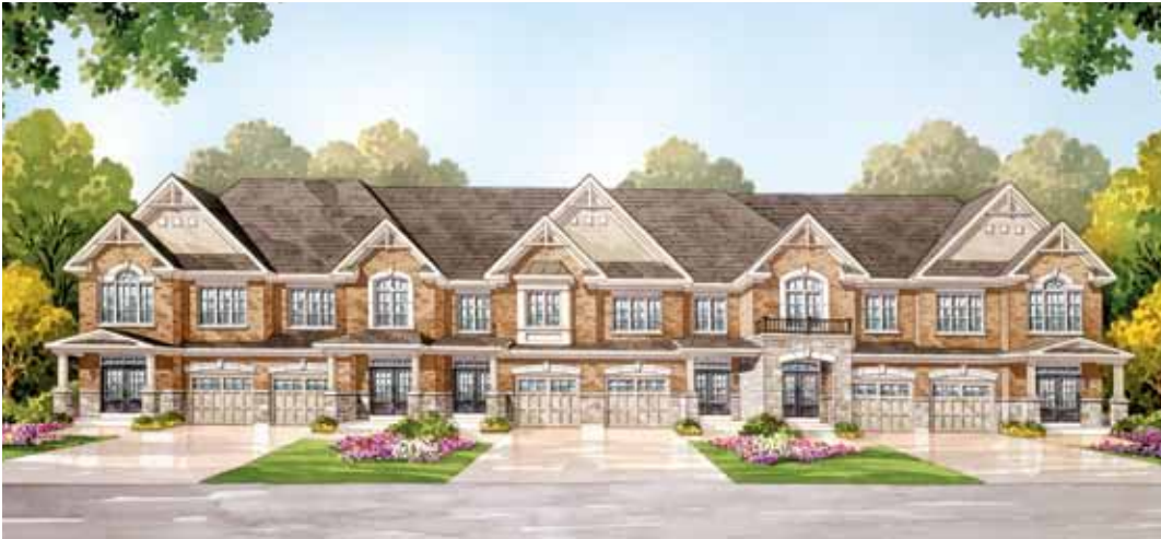
SPRUCE A BIRCH A POPLAR A POPLAR C MAPLE A SPRUCE A