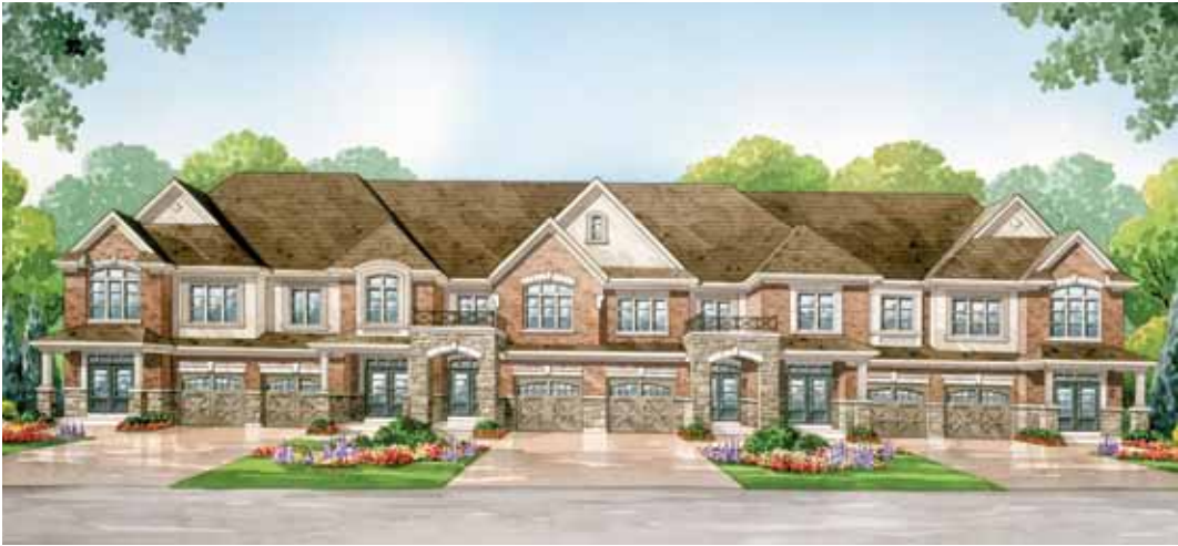
SPRUCE B BIRCH B POPLAR B POPLAR D MAPLE B SPRUCE B